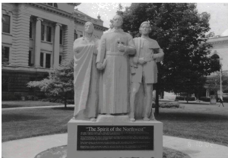
Monument to Nicolas Perrot in Wisconsin

In the Spring of 1687, Perrot brings the fruits of his trade to the Saint-François-Xavier mission and heads with his allies to Detroit into enemy territory, where he takes part in the destruction of five villages. But, in the meantime, fire destroys the Saint-François-Xavier mission and Perrot's furs, who finds himself ruined. And, in spite of all his efforts to correct the situation, he will never recover from this financial setback.